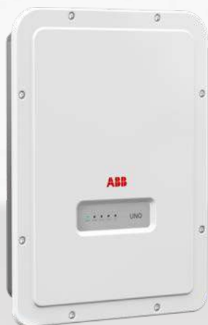
— UNO-DM-TL-PLUS-Q outdoor string inverter

UNO-DM-1.2/2.0/3.0-TL-PLUS-Q 1.2 to 3.0 kW